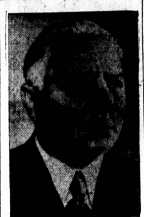
IN CIVIES — Marshal Klementi E. Voroshilov, chairman of the Presidium of the Supreme Soviet of the U.S.S.R., wears civilian clothes as he poses for his latest portrait. Long a military hero, his position is comparable to president of Russia.

The growth of all top-work grafts on the Hibernial stock are satisfactory and we consider this stock to be very suitable for most varieties as grown in Prince Edward Island. The Osman has not