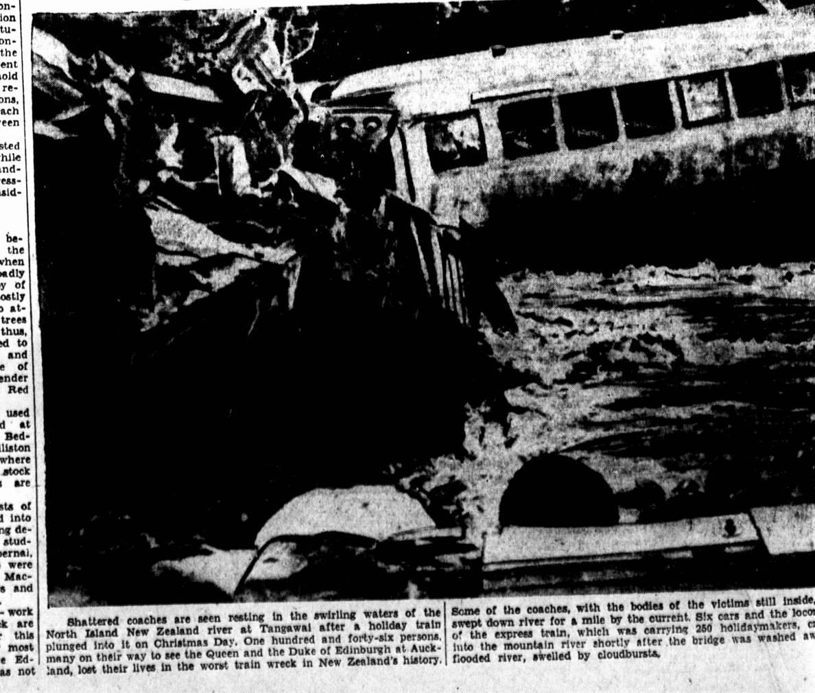
Shattered coaches are seen resting in the swirling waters of the North Island New Zealand river at Tangawari after a holiday train swept down river for a mile by the current. Six cars and the locomotive of the express train, which was carrying 250 holidaymakers, crashed into the mountain river shortly after the bridge was washed away by flooded river, swelled by cloudbursts.