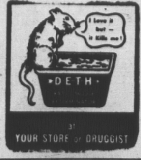
YOUR STORE or DRUGGIST