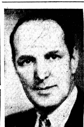
Mr. J. Watson MacNaught, M.P., who will be guest speaker at the annual dinner here tonight of the East Coast Fisheries Conference.