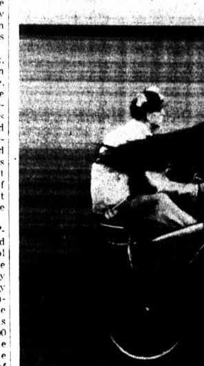
DEAN GALLON 2:08 2/5