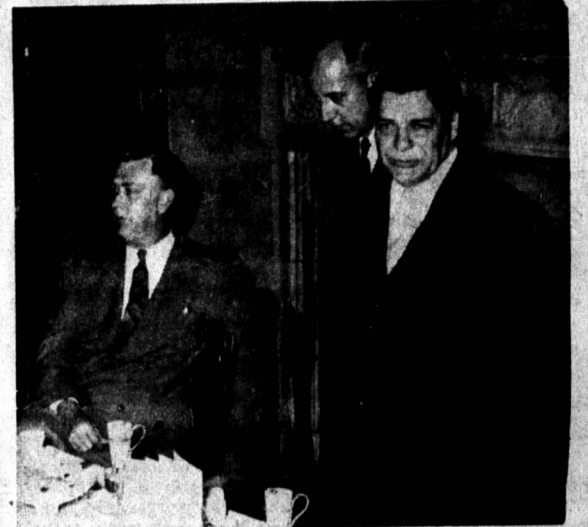
RUSSIAN FISHERIES CHIEF VISITS PROVINCE