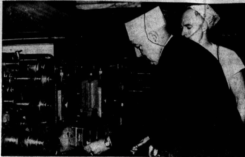
GOVERNOR PROWSE STARTS PRESS IN NEW GUARDIAN BUILDING