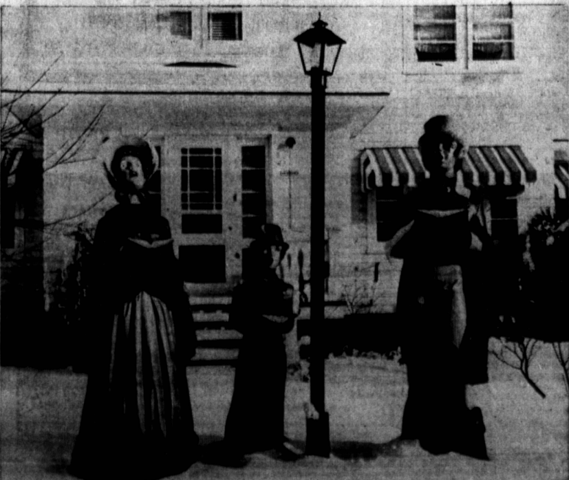
LIFE-LIKE CAROLLERS DELIGHT THE RESIDENTS OF MURRAY RIVER