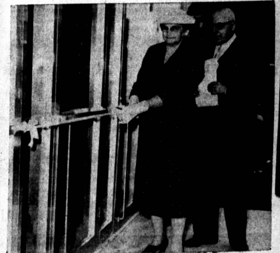
MRS. DOUGLAS OPENS NEW FEDERAL BUILDING