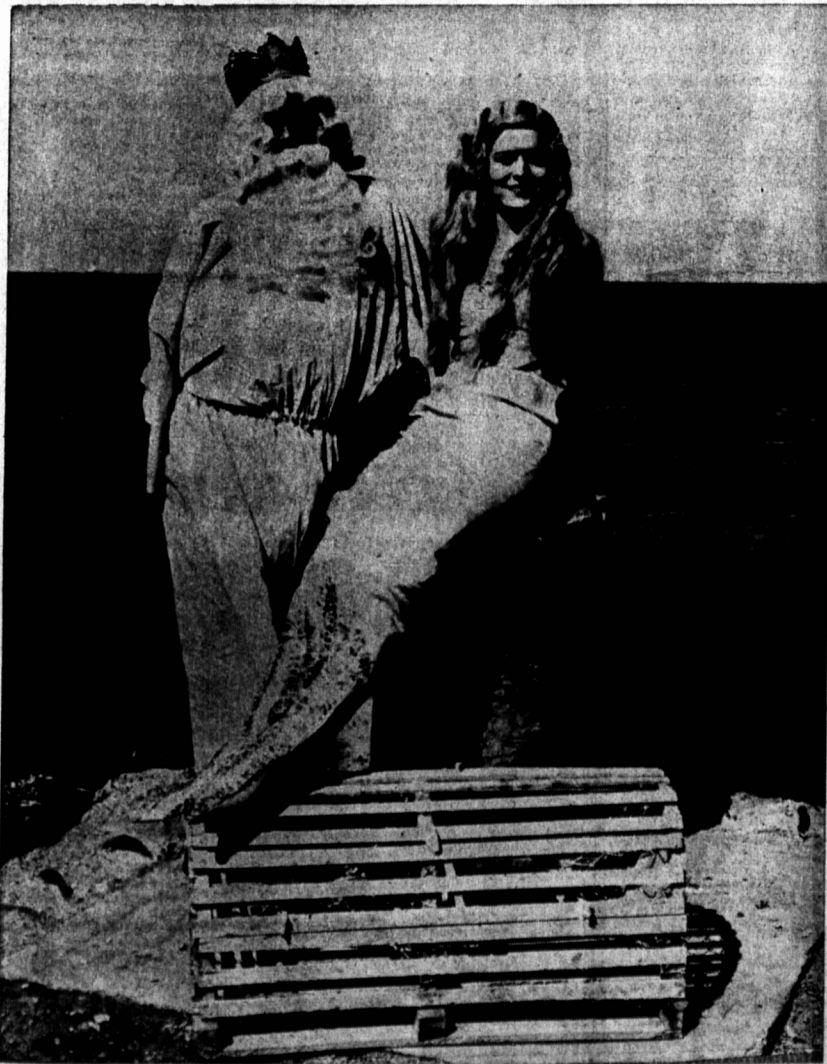
KING NEPTUNE AND THE MERMAID AT SUMMERSIDE LOBSTER CARNIVAL