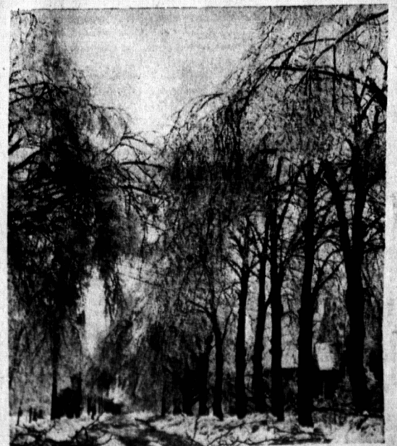
DESTRUCTIVE BEAUTY OF THE SLEET