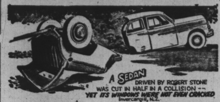
DRIVEN BY ROBERT STONE WAS CUT IN HALF IN A COLLISION... YET ITS WINDSHIELD WERE NOT EVEN CRACKED