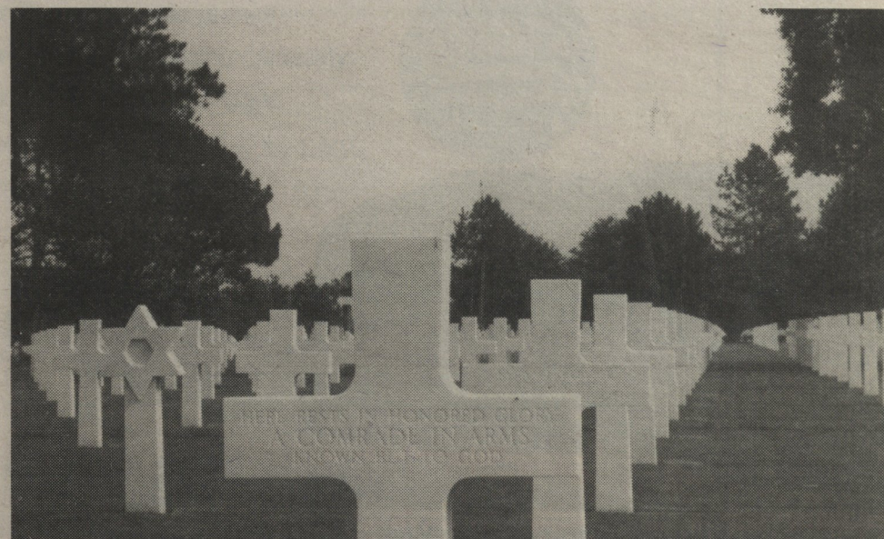
One of the countless reasons for silence this Remembrance Day