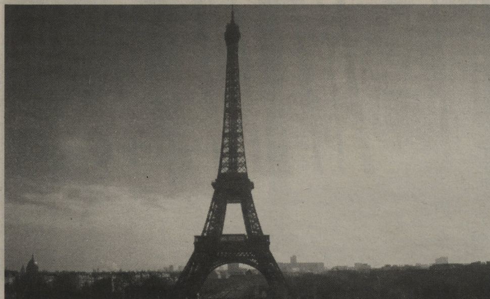
The Eiffel Tower in Paris - Not so big in person