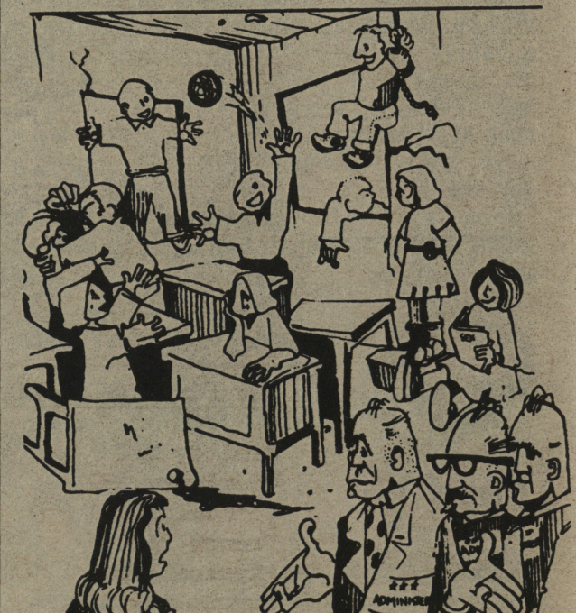
"What teacher? We have to cut costs somewhere!"