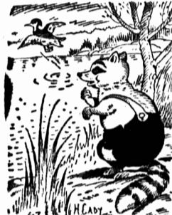
By and by Beauty took to his wings.

Now Bobby Coon is smart. He isn't easily fooled. He guessed just what the pretty Wood Duck was doing.