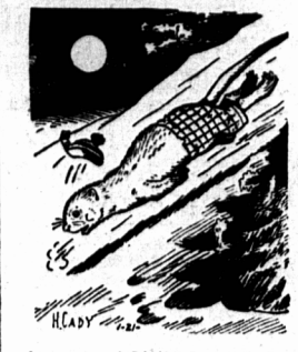
Away went Little Joe flat on his stomach down to the bottom.

It happened that the two young foxes who were out hunting discovered what was going on. To them, Little Joe and his family were complete strangers. Neither of them had ever before seen any what to make of the short-legged, long-bodied folk. From the shelter of some brush they watched that sliding party, and thought it was one of the craziest sights they