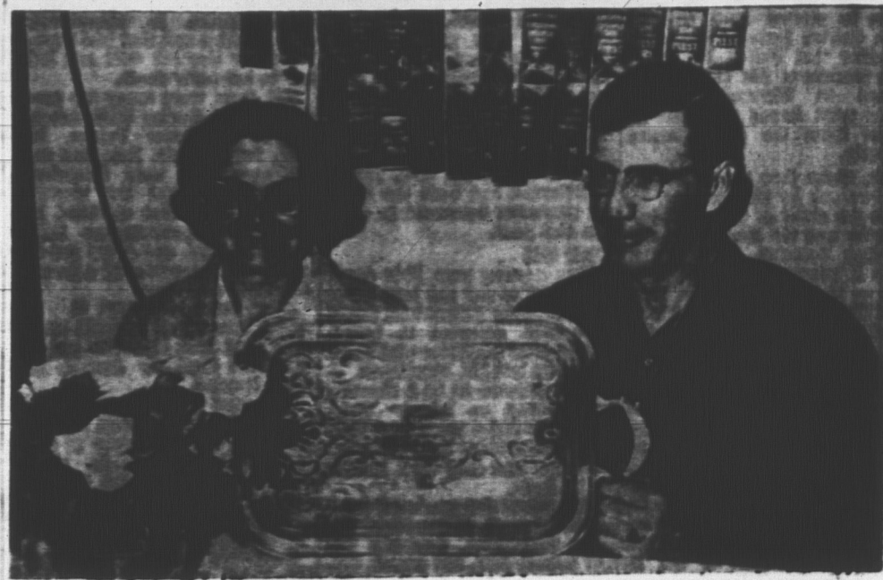
PROUD OWNERS OF CHAMPIONS

There are 40 animals in the Myers barn with 15 to 20 cows milking at any given time.