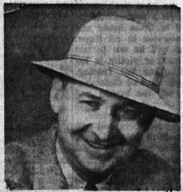
"THE WHITE HUNTER"

YES! the "WHITE HUNTER" has gone BESERK and he's slashing prices left and right. Which makes it possible for you, the customer, to buy at a lower price. All weekend he was caught slashing the axe into prices on items, and did he ever cut them. So call and see the many items that he has slashed and go home with a new Firestone Refrigerator PLUS A FREE GIFT OF YOUR CHOICE. DON'T MISS IT.