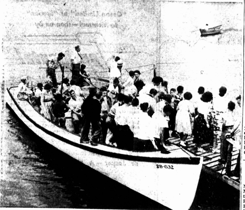
ONE OF THE MANY pleasant attractions provided the large crowd who attended the West Prince Board of Trade Aquatic Sports Day at Alberton was a scenic boat ride between the Kiddie and Montrose bridges. Photographed above is a group of sight-seers arriving back at the dock after following the route of the three mile swimming race.