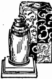
YARDLEY OLD ENGLISH LAVENDER, Lovable Fragrance — so gay, so young, so Feminine. Christmas boxed. A fine gift for Women, young and older.