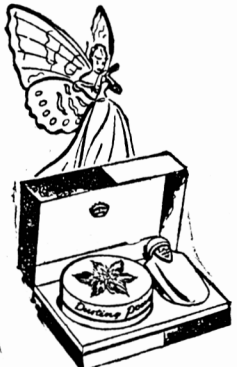
LADIES' GIFT SET, Christmas boxed, consisting of Dusting Powder and Lotus Cologne — that New sophisticated scent.

The Name and Quality that make your Gifts unforgettable.