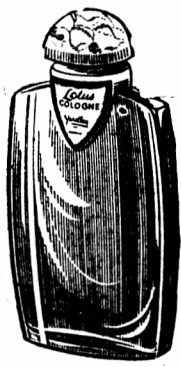
LOTUS COLOGNE, a Cologne delicately different, a beguiling way for Her to stay flower-fresh all day, Christmas Boxed.