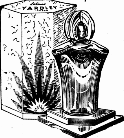
LOTUS PERFUME, that sophisticated New Perfume by Yardley. A Perfume that all women love, a perfume that all women love to have. A Perfect Gift. Christmas Boxed.