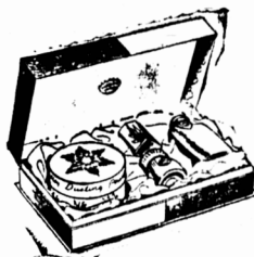
LADIES' COSMETIC SET, the "Perfect Gift". The set includes the Lotus dusting powder, Lotus cologne, Lotus perfume, and that lovely Lotus perfume. Christmas Boxed. The Gift she'll truly treasure.