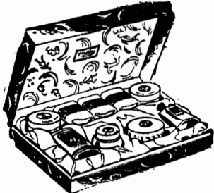
LADIES' GIFT SET, Christmas boxed, consisting of 3 tablets of Lavender Soap, face powder and face cream, two make-up bases, talcum and Old English Lavender.