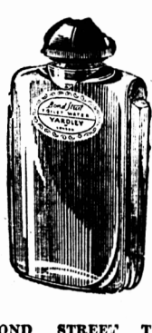
BOND STREET TOILET WATER, light, lingering and lovely for both daytime use and an after-bath luxury, Christmas Boxed.