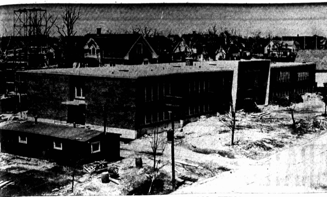
Grades 10, 11, 12, and possibly grade 9, will begin classes in Summerside's new High School when the fall term begins in September.

TORONTO (CP)—The provincial health department announced Monday that delivery of fresh Salk anti-polio vaccine supplies will enable an immediate start on a second-shot program for 50,000 Toronto public school children. Supplies would not be enough to finish the task but it was hoped more deliveries this week would see the program through. Shots for pre-school children and high school students would be delayed until later.