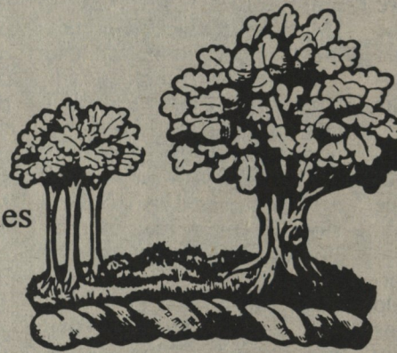
P.E.I.s 3 counties