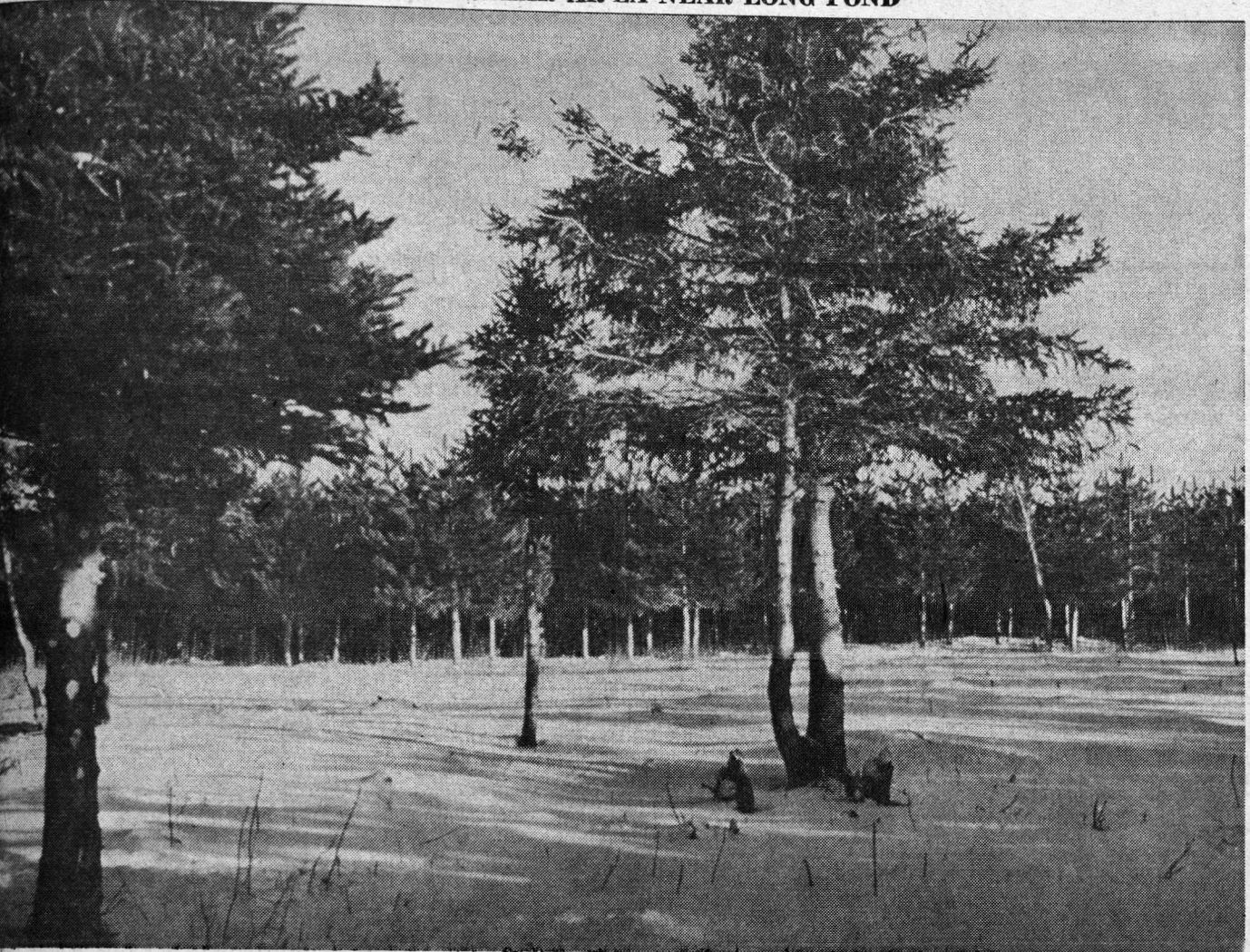
PINE PLANTATION FOLLOWING CLEAN-UP