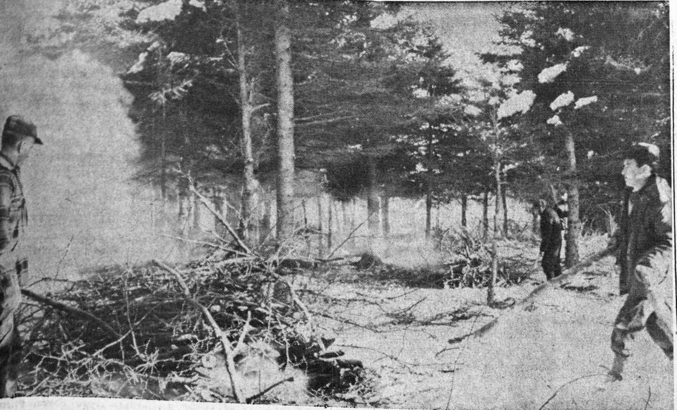
WORKMEN CLEAR AREA NEAR LONG POND