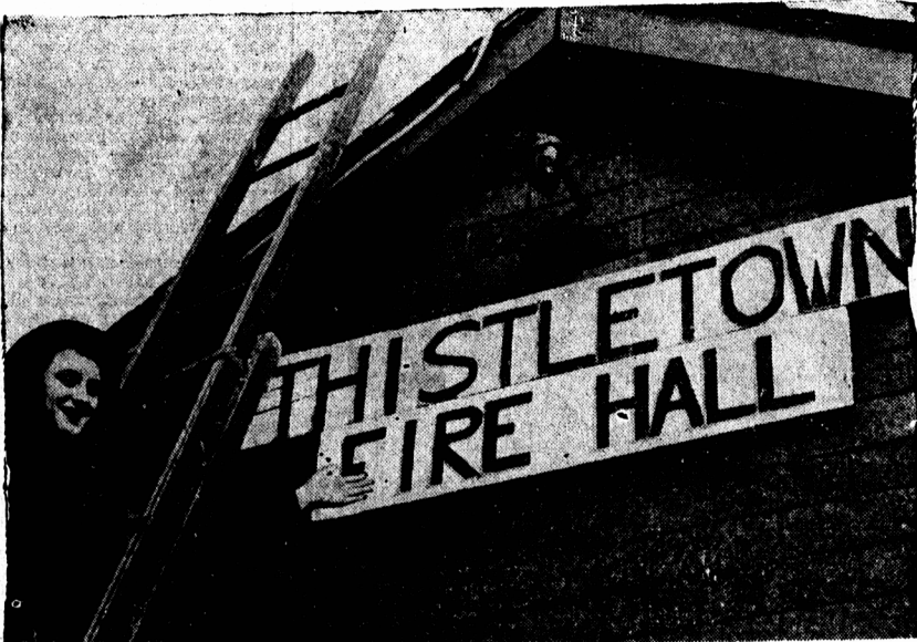
Four hundred residents of Thistletown, just 15 miles from Toronto and one of the fastest growing communities in Ontario, are against amalgamation with Toronto and intend to fight the project all the way. Their arguments against amalgamation is their taxes would be higher, industries would spring up everywhere, spoiling their peace and tranquility, and what do they need the city for when they have "a good fire department, hydro system, bus transportation, paved roads—everything you can ask for in a city." Carole Morphet is seen proudly pointing to fire hall.