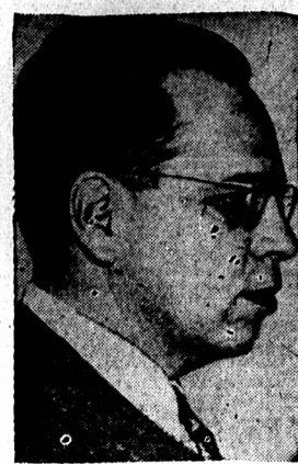
Leon H. Keyserling, chairman of President Truman's council of economic advisers, told reporters that the nation now is at a peak of post-war prosperity. And for the future, he added, "the outlook is good". After a White House meeting with Mr. Truman, Keyserling said that in "real terms" of productivity the second three months of 1950 represented an all-time peak. He said output is higher than at any time since 1948. He added that he does not expect the level to go down.