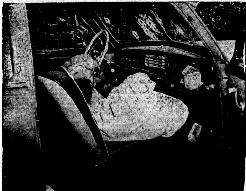
Overtaken on a narrow, sandy road near the hamlet of Langton, Ont., a bank bandit opened fire through the rear window of his car and instantly killed the two men who had chased him. The bandit had just robbed a Langton bank of $23,000. Bandit's victims are shown slumped in front seat of pursuit car in which they were killed.