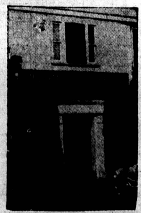
The Imperial Bank of Canada in Langton, a hamlet, near Simcoe, Ont., where the robbery took place, is shown.