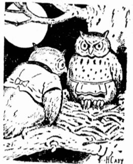
"I don't know," he confessed, "you tell."

Of all the feathered folk in the Green Forest none is more fierce than Hooty the Great Horned Owl. He is fierce and he is fearless. All his neighbors his own size and smaller and some who are bigger, are afraid of him. They have the greatest respect for his big, sharp, curved claws and his wicked-looking hooked bill. But big and fierce as he is he knows what it is to despair. He was in despair now and so was Mrs. Hooty, who is just as fierce and bold and daring. It was all because of Prickly Porky the Porcupine. He was climbing the tree in which was their nest, and in that nest were the two most precious babies in all the Great World. Every baby is the most precious baby. Just ask the mother of any baby.