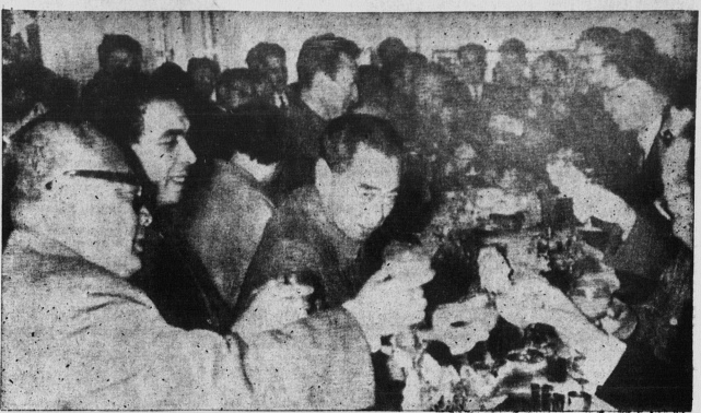
A RED CHINESE-ALGERIAN TOAST Communist China's Premier Chou En-Lai, facing camera third from left, and other Red Chinese and Algerian government officials make a toast with orange juice after visiting government committee-managed farm at Boufarik, 30 miles from Algiers, Sunday. Other toasting, from left, are Chen Yi, Red Chinese foreign minister; All