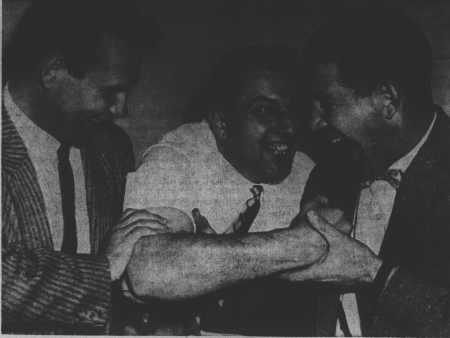
NEW RIDER ARM

CITY SOFTBALLERS will meet tonight at 7:30 at Holy Name Hall to appoint their executive for the coming year.