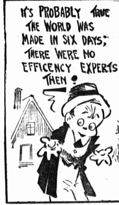
IT'S PROBABLY TRUE THE WORLD WAS MADE IN SIX DAYS; THERE WERE NO EFFICIENCY EXPERTS THEN!