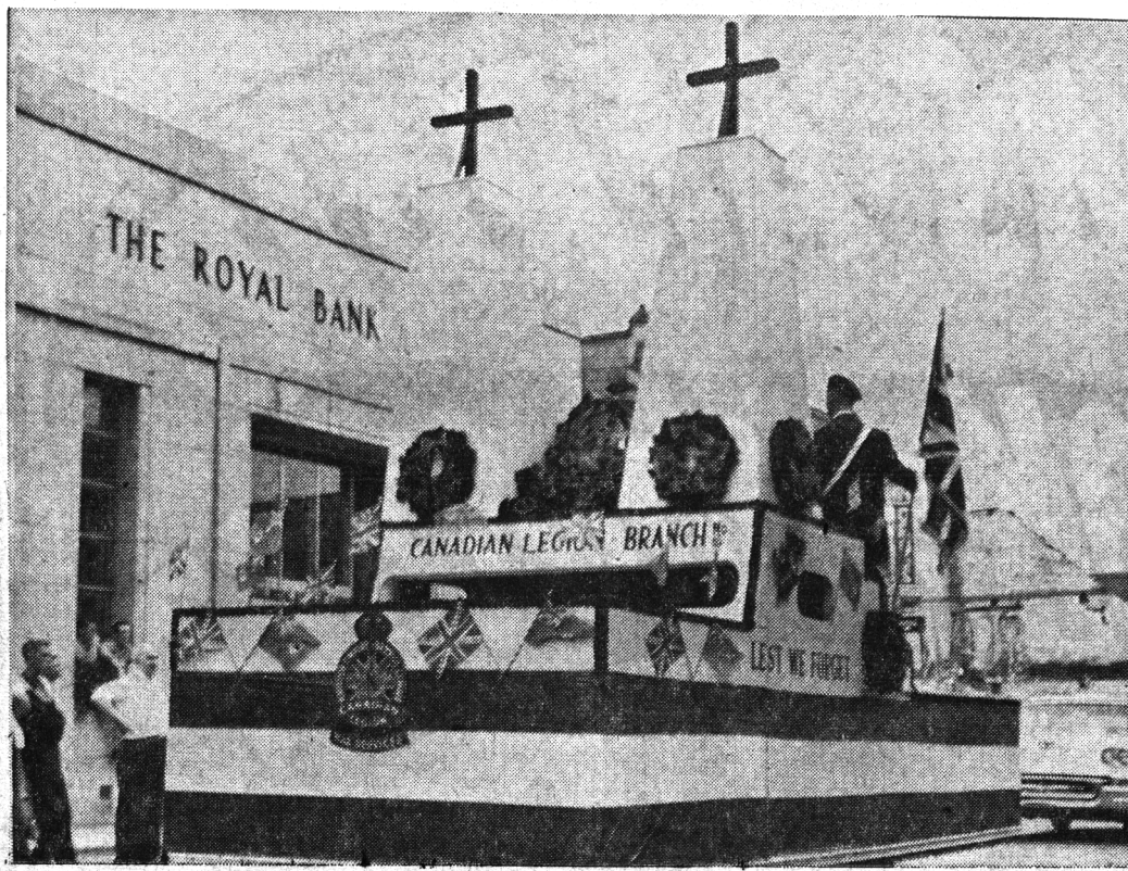
HONOURED THE BRAVE ...