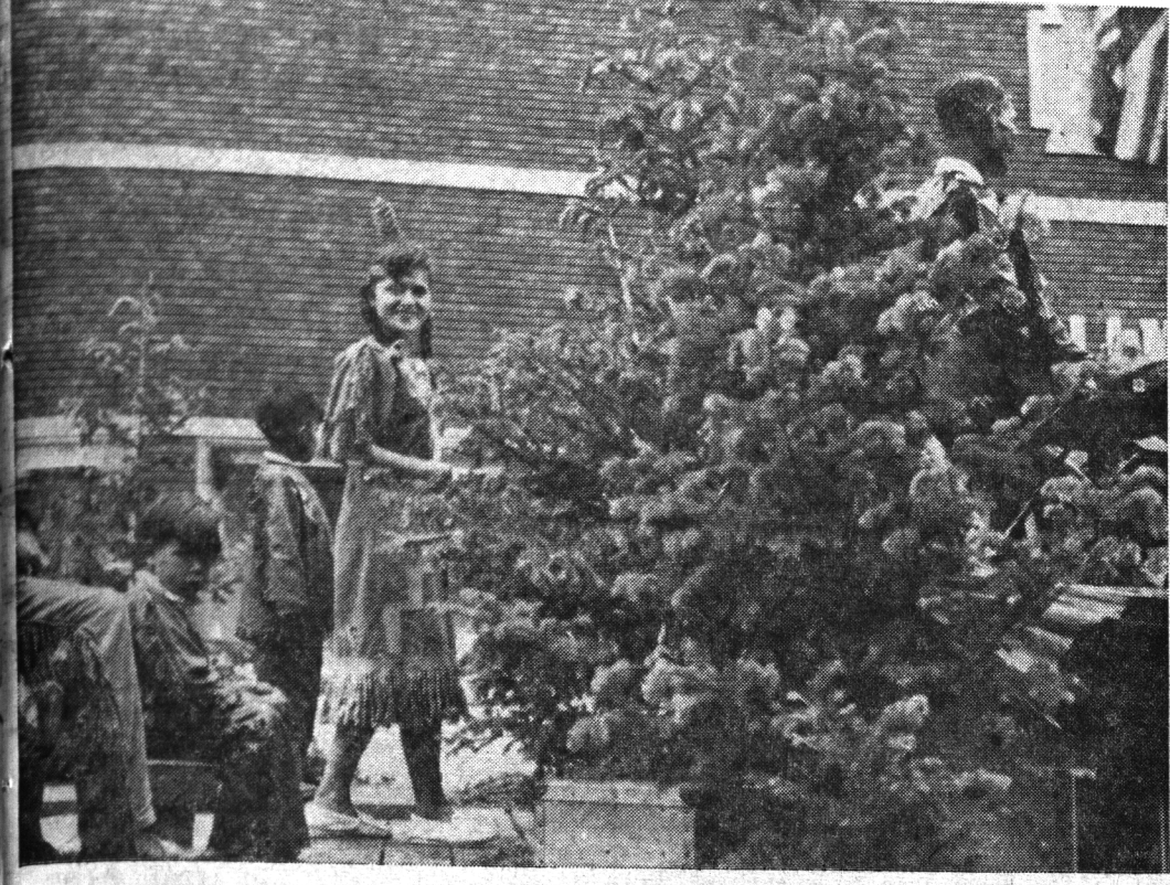
FLOATS FEATURED AN INDIAN MAID ...