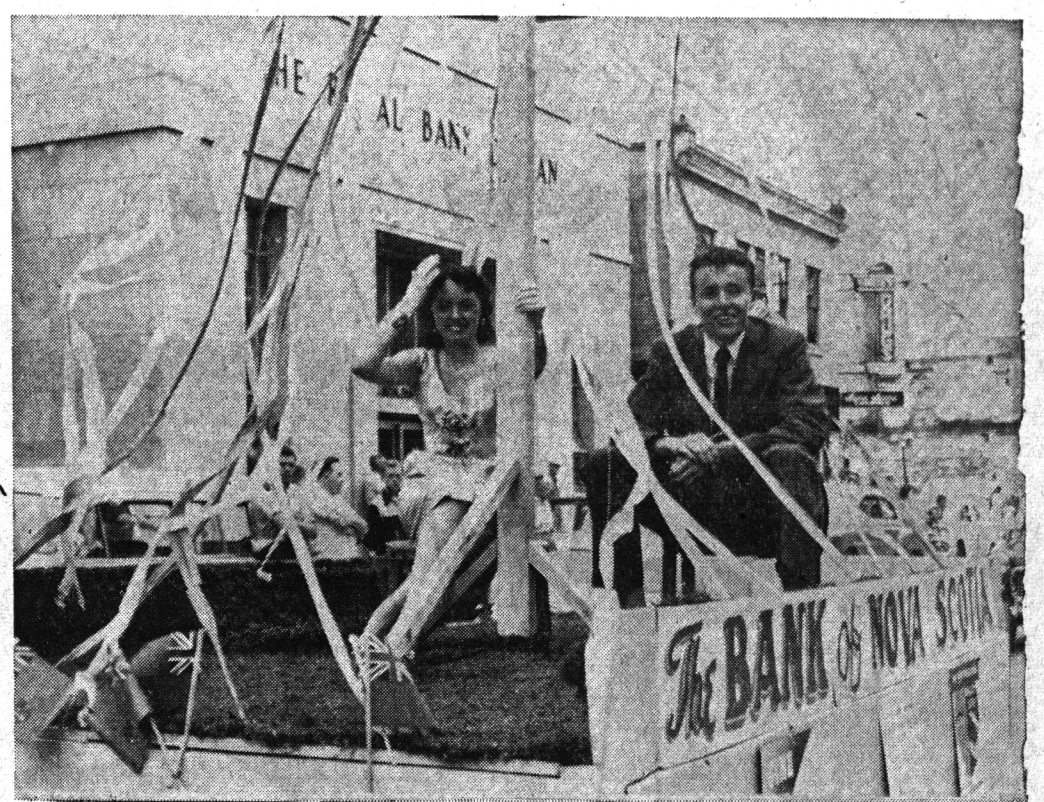
AND WERE MERELY GAY