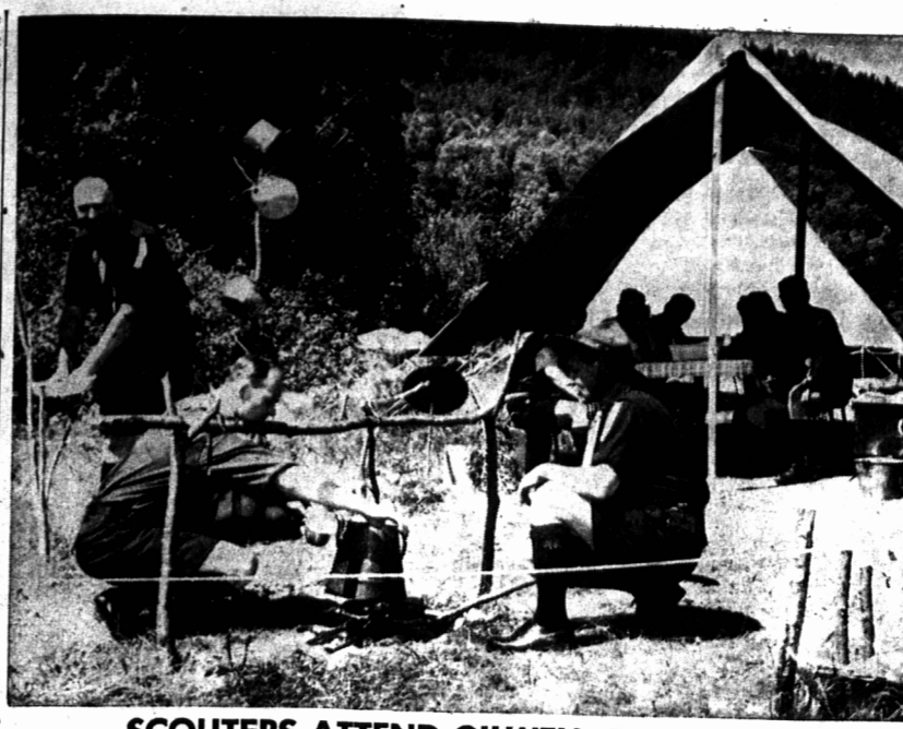
SCOUTERS ATTEND GILWELL CAMP

continuing the construction of the Trans-Canada highway between Charlottetown and Wood Islands and this is providing summer work for a large number of men. Highway construction is also being carried out in the National Park by the Dominion government, and in the park also other intensive improvements are under way. Some summer hotels on the north side of the Island report business as below that of a year ago. The hotel owners say fewer tourists are paying guests have come to the Island probably because of the unfavourable weather in early summer. The owners report an increased demand for accommodation in the past few days, and some hotels are now crowded. Lumbering is not a big industry in the Province, but wood pulp and pit props are being cut on the wood lots of many Island farmers, and these are being stock-piled to await shipment from such ports as Souris Montague, and Georgetown. The local National Employment Office reports that some boys of grade school and high school age are still idle and looking for summer work. The office also states that some men in the older age groups, who were unable to take anything but light work are idle.