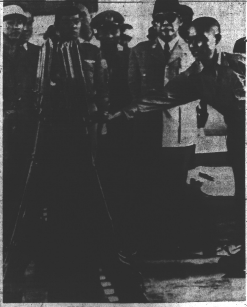
CHOOSING A WEAPON