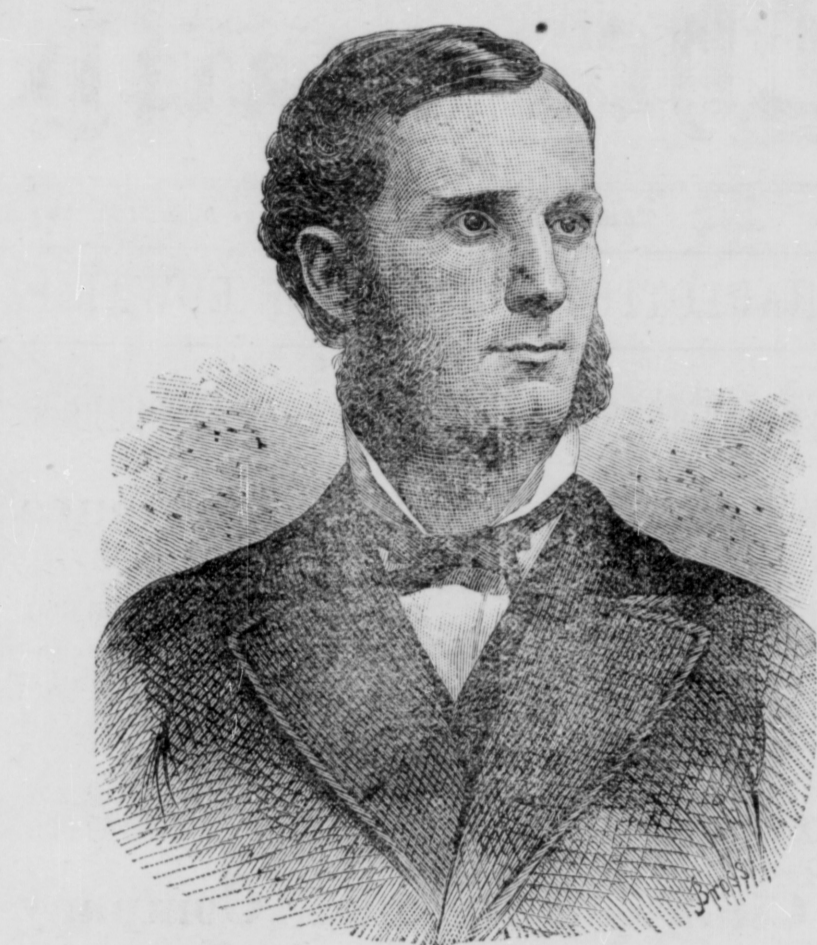
HON. JOHN B. FINCH.

A COMMON assault was disposed of at the Stipendiary Magistrate's Court this forenoon. The 82nd Battalion Band will be at Roller Rink to-night from 8 o'clock until 10. The Ice Cream at Macdonald's Confectionery is simply immense. Call and get some.