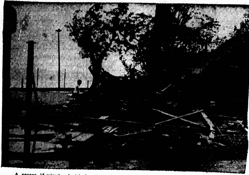
A severe 15-minute electrical, wind and rain storm ripped through the Windsor district recently, injuring nearly a score of persons and causing an estimated $100,000 damage. The storm, which cut a narrow path from west to east, just missed the downtown district, whistling eastward to suburban and held a velocity of 65 miles m.p.h. for nearly two minutes—left in its wake broken windows, uprooted trees, fires, broken roofs of houses, garages, seen above.