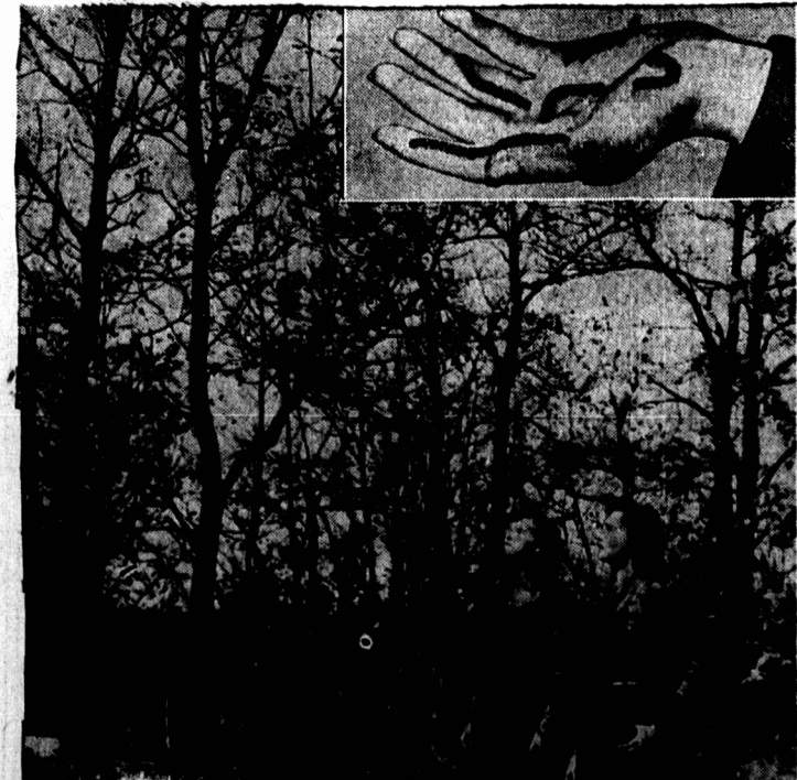
It's like fall in some sections of Muskoka, Ont., where a great plague of tent caterpillars has stripped the foliage from the trees. Joyce Genoe and Audrey Deyette stand behind ruined trees, at left. Close-up shows pests. Tree, crawling with destructive worms, at right, is examined by