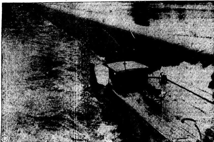
A small cabin cruiser is battered against the spillway near Oakmont, Pa., in the swift waters of the Allegheny River. Four were rescued, but four drowned, two of them being would-be rescuers.