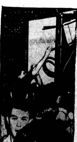
RIVAL CLASH IN PARIS Infiltrating a meeting of 250 members of a Titoist organization in Paris, 100 pro-Russian Communists attempt to "work over" their rival group with a few chairs and whatever else comes to hand. The sortie ended with the Titoists ejecting the blood-smeared pro-Moscow Communists before the police arrived. Fourteen of the rioters were injured and 10 others were taken into custody.