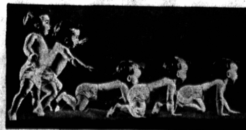
This high-speed action photograph proves, as only a camera can, how free and comfortable baby is!

Playtex Dryper Panty..... each $1.69 100 Playtex Dryper Pads regular size .... $1.39 100 Playtex Dryper Pads large size ..... $1.59