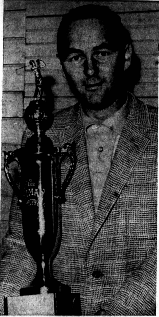
N. B. - P. E. I. GOLF CHAMPION

CHARLOTTETOWN CANADA, THURSDAY, JULY 25, 1957