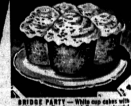
BRIDE PARTY — White cup cakes with white icing. For fun and flavor, colorful nonpareils or chopped almonds to top the icing.