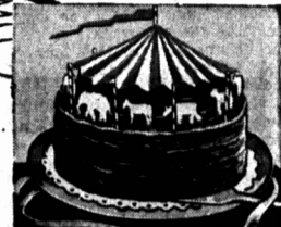
CIRCUS — Spice cake — chocolate icing — decorate with animal crackers marching upright under a "tent" of colorful accordion-pleated tissue paper. Tent "props" are cellophane straws.

BRODIE TWIN PACK CAKE MIXES... in the YELLOW package with the big RED letters