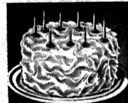
BIRTHDAY — Nothing nicer than white cake with pink icing — red roses to hold white candles. Make it a pretty pink, red and white party!