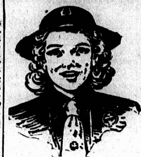
Attention all Guide Leaders and Brown Owl Tawny Owl.

Training will commence on March 6th, Monday at 8.45 p.m. until 8.45 p.m. in Trinity Hall; Monday 19th, same time in Zion Hall; Monday 20th, same time Zion Hall and Monday 27th same time Trinity. You will remember that all Leaders voted for this training course at Guiders Club and we therefore hope for a full attendance at all meetings.