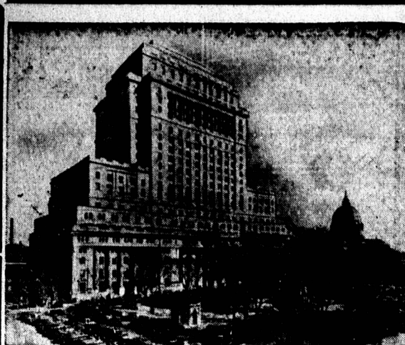
The following Representatives of the Sun Life of Canada in Prince Edward Island will be glad to discuss with you any matters relating to life insurance or annuities, without obligation.