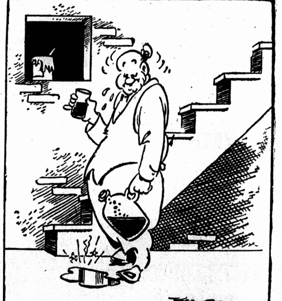
"Humm-m-m! There's something wrong with this sweet cider I got last month with a Guardian Want Ad—I keep wanting to sing!"