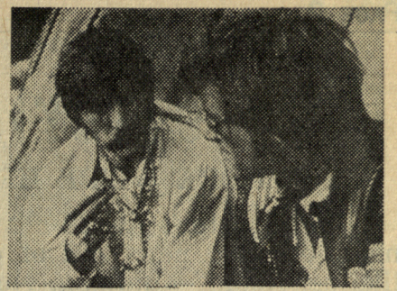
Staff discusses deserting editors