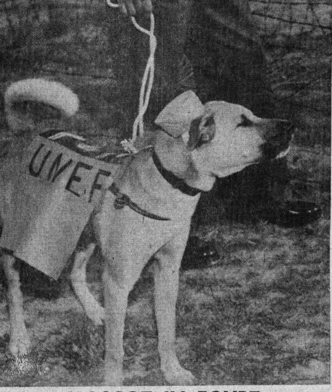
Members of the Royal Canadian Ordnance Corps serving with the Canadian Contingent of the United Nations Emergency Force in Egypt have adopted a mascot, and named him "Mugs".