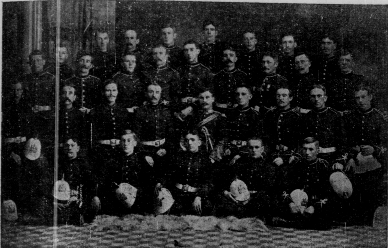
THE FIRST P. E. ISLAND CONTINGENT.