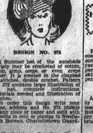
DESIGN NO. 273

A Summer hat of the sunshade variety may be crocheted of cotton, linen, gimp, crepe, or even crepe paper. It is created in the simplest of stitches, double crochet. Pattern No. 273 contains large illustration of the hat, complete instructions, materials needed and illustration of stitches.