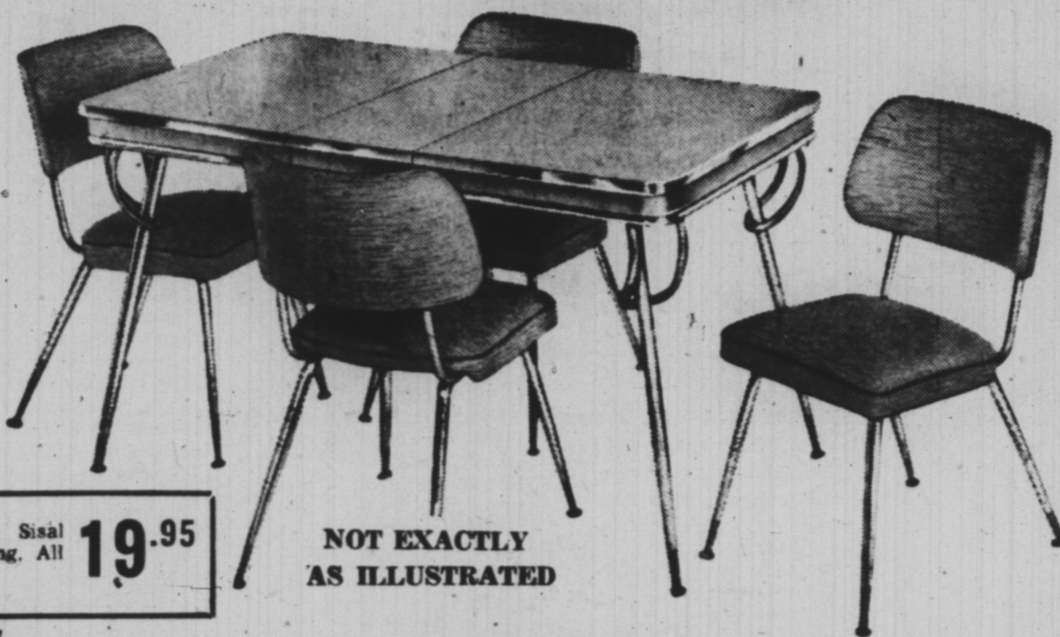
Table 30 x 40 x 48. Tapered chrome legs. Wide steel band. Top Calypso or Verona. Chairs wrap around seats 17" tubing. Solid construction. Lovely color combinations. White and Black, White and Red, White and Blue, Yellow, Beige. Reg. $69.95.

will rejuvenate your HOME as well as SAVE YOU 20.00