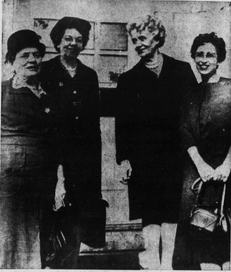
VOW DELEGATES HEAD FOR RUSSIA

"Covers Prince Edward Island Like The Dew"