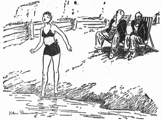
Friend (to late parent): "It's no good, old chap, all daughters nowadays are alike in many respects!"—Humorist.