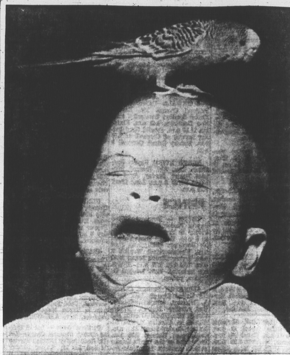
BIRD ON THE BRAIN

MURRAY HARBOR — Murray River United Church. Pas-