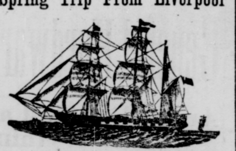
THE CLIPPER BARKENTINE