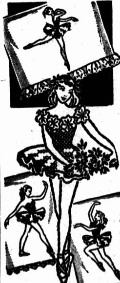
7158 by Alice Brooks

Easiest stitches (mainly quick cross-stitch and outline) make the prettiest designs ever! Embroider them on towels, panels to frame, linens. Make gay shower gifts! Embroidery Pattern 7158: twelve ballet dancers, 5 1/2 to 7 1/2 inches tall; 32 flowers 1 to 3 inches. Send TWENTY-FIVE CENTS in coins for this pattern (stamps cannot be accepted) to Charlottetown Guardian, Household Arts Dept., 60 Front St. W., Toronto, Ont. Print plainly NAME ADDRESS, PATTERN NUMBER. Order our ALICE BROOKS pages and pages of exciting new designs — knitting crochet, embroidery, iron-ons, toys and novelties! Send 25 cents for your copy of this wonderful book now. You'll want to order every design in it!