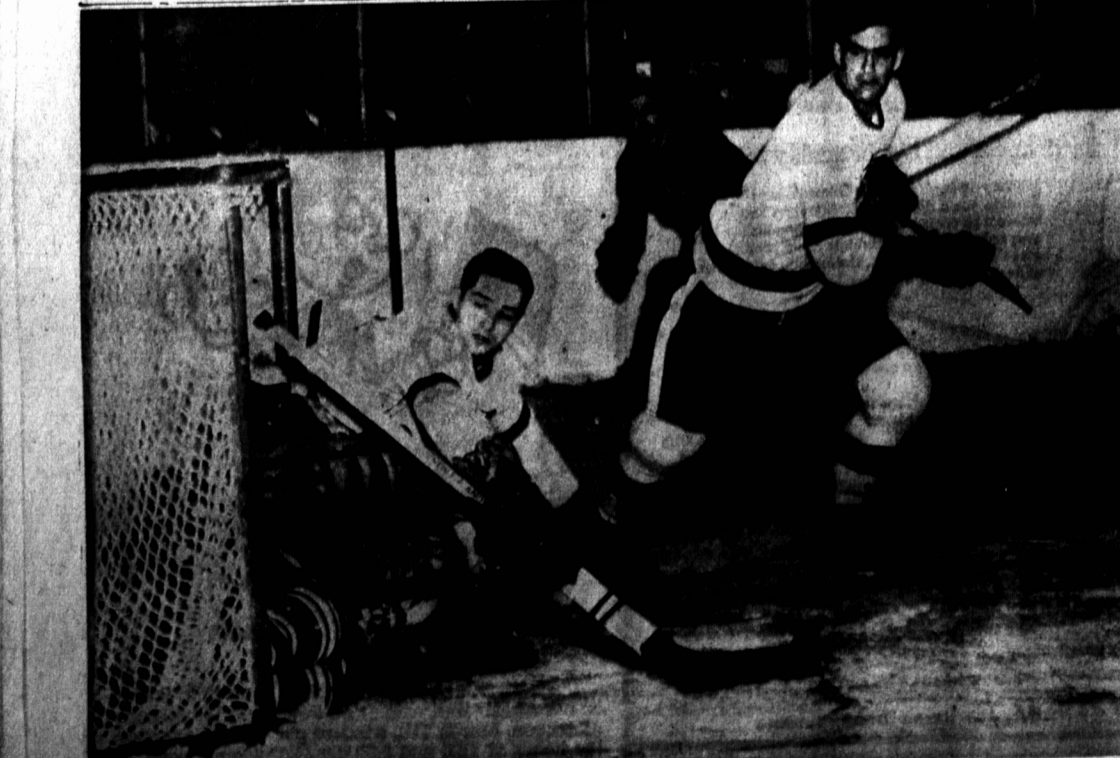
Duff Crashes Detroit Net Goalie Glen Hall of Detroit Red Toronto Maple Leafs who slid into game in Toronto. Duff was bumped and went flying into net. The Wings and Leafs fought to a 2-2 tie in the game.

8 P. M.—All sheets of ice will be used for mixed curling.