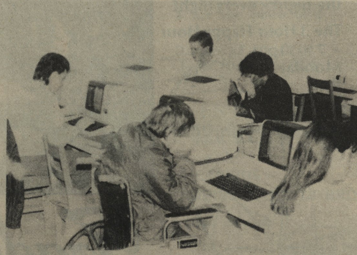
A quiet night at the library terminal room. Students working on term papers and computer assignments.

Hancock feels that "students are very considerate of equipment" and wishes to thank them for that. Students don't have to be kicked out of the terminal room early in the evening to protect the equipment from vandals and thieves, as other universities are required to do.