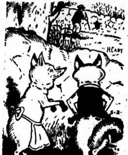
They saw him stop at Johnny Chuck's house.

Mrs. Reddy Fox had made up her mind. It hadn't been made up in a hurry. Mrs. Reddy would tell you that there is nothing more foolish than to make up one's mind in a hurry in a matter of real importance. Nothing leads to so many bad mistakes as unnecessary hurry. So Mrs. Reddy had been slow to decide that she and Reddy should move from the Old Pasture and dig a new home some distance away. It was a trap that had decided her. It was the third one that she and Reddy had found recently in the Old Pasture near their home. She had almost stepped in this one. It was just good luck that its cruel steel jaws had not snapped together on one of her legs. She had uncovered that trap and sprung it by slipping a paw under it and flipping it over. She had shivered at the ugly sound of those wicked jaws when they had snapped together on nothing. The Old Pasture would no longer be a