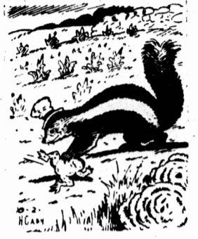
He rolled him over and over.

was. "Too bad. It is too, too bad. He is such a nice young fellow. I shall miss him a lot. But there isn't a thing I can do for him, and there isn't a thing he can do for himself. Too, too bad." It did look very hopeless, thought Old Mr. Toad, for Young Toad. It was true he couldn't do anything for himself. If he was in despair he had good reason to be. When one is utterly helpless in time of grave danger it is difficult if not impossible to yield to despair.