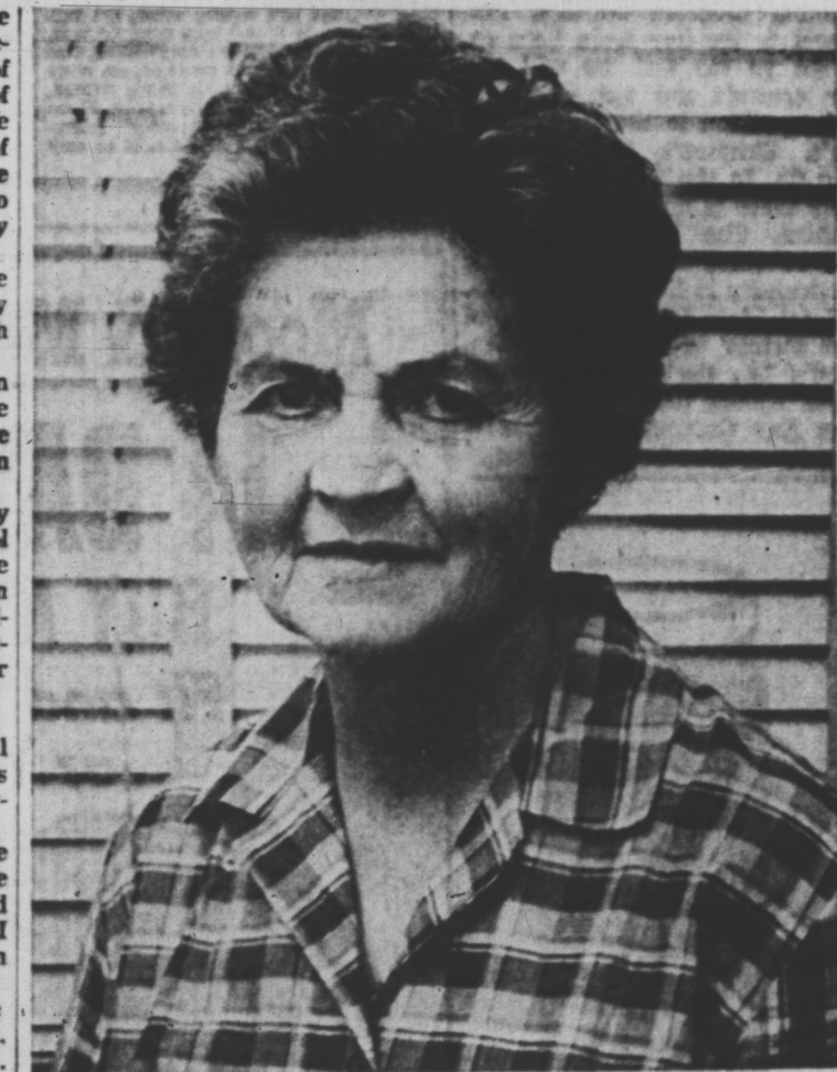
"MOTHER OF THE YEAR"