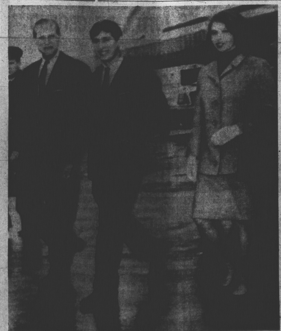
PRINCE CHARLES OFF TO AUSTRALIA

The statement said there has been a "particularly serious" situation in the lobster fishery where a minority group of fishermen persistently broke regulations. "Some have, on occasion, attacked fishery officers and damaged patrol boats," it added.