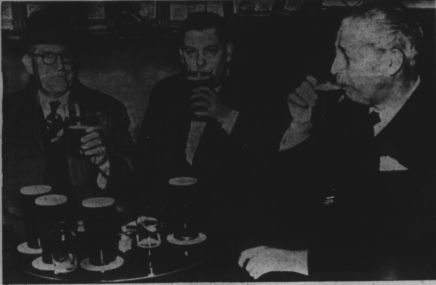
'ALE AND 'EARTY

British Prime Minister Harold Macmillan (right) enjoys a glass of ale with other customers at the Royal Victoria Hotel in West Hartlepool, England, during his tour of the city.