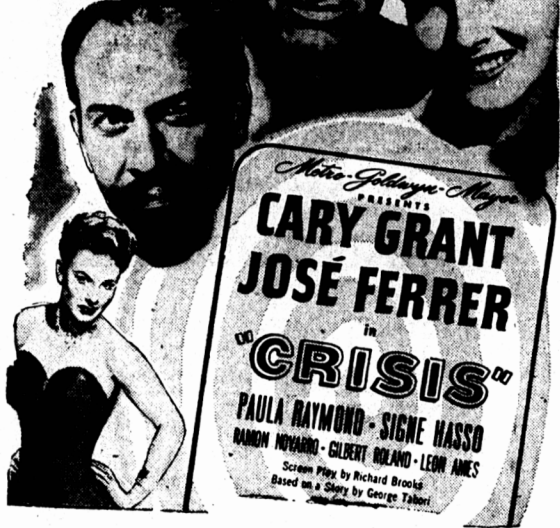
Extra: People On Parade; Egypt Speaks; Cartoon

There's romance in the moonlight... there's danger in the paradise where Cary and his lovely bride come for a carefree holiday!