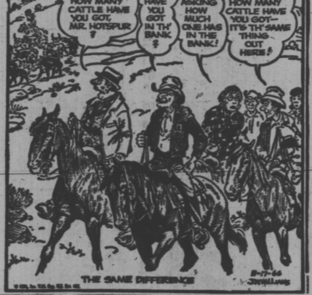
THE SAME DIFFERENCE

WANTED SECOND-hand riding saddle, all 16 gauges about gun. Telephone 4-7948.